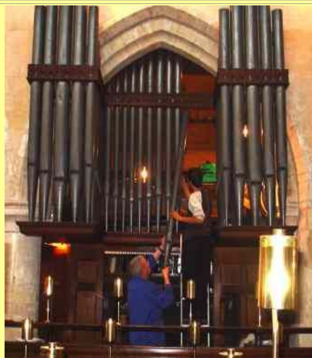
A pipe being reinstated