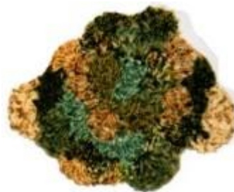
A crochet "scrumble" from Freeform Knitting by Prudence Mapstone

Unfortunately, I've been so busy planning that I haven't got to the sample stage yet - so instead I'm just showing some of the ideas from these interesting books.